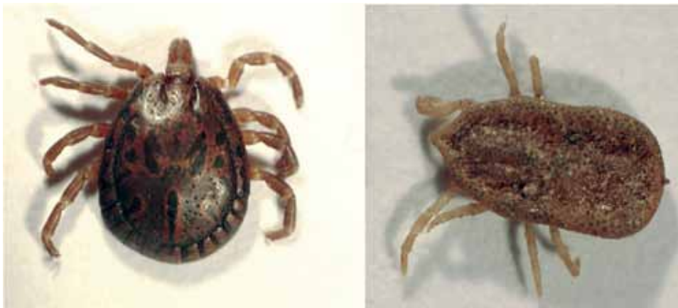
Figure 2. Amblyomma loculosum (left) and Carios capensis (right) ticks from seabird colonies on western Indian Ocean islands.

Partial sequencing was performed on the Rickettsia spp. gltA gene from 60 ticks, including ticks from each island and both species. Phylogenetic analyses revealed 7 haplotypes clustering in 4 well-supported clades; some of the haplotypes corresponded to previously described species (Figure 3). No association was found between Rickettsia spp. and collection location (island), but strong host (tick) specificity was observed (Figure 3). All A. loculosum ticks were infected with a Rickettsia strain showing 100% nt identity with the R. africae strain infecting A. loculosum ticks in New Caledonia and with the ESF-5 strain isolated from the cattle tick, A. variegatum , in Ethiopia (GenBank accession no. CP001612.1). Rickettsia spp. in C. capensis ticks had 3 well-supported genetic clusters and, thus, were more diverse. The most frequent Rickettsia sp. in these ticks (64% of the sequences) was a probable strain of R. hoogstraalii . Other haplotypes corresponded to an unknown Rickettsia sp. that was closely related to R. hoogstraalii and to a probable strain of R. bellii (28% and 8% of the sequences, respectively). The haplotype of R. bellii was detected only on Réunion Island in 2 C. capensis ticks collected within the same nest of the wedge-tailed shearwater ( Puffinus pacificus ).